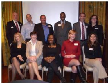
2011 Candidates and Committee Members at the Man & Woman of the Year Kickoff